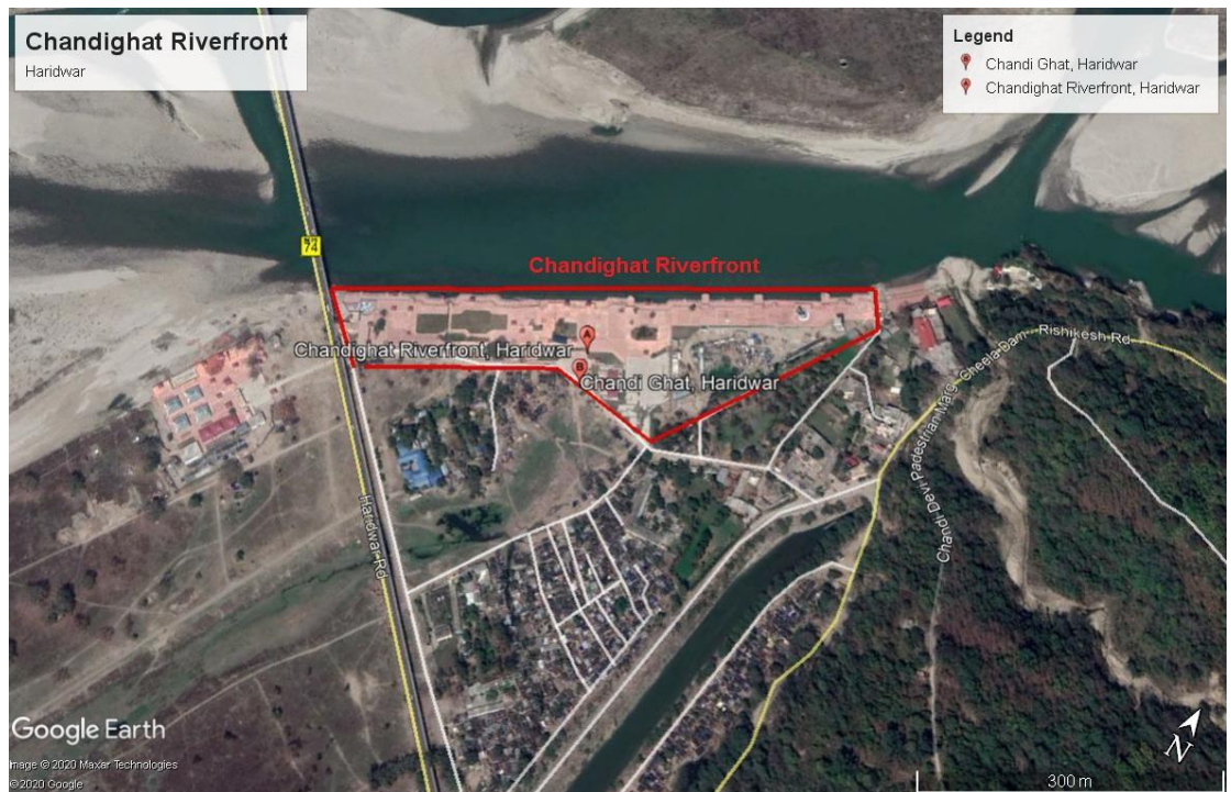
Figure-1.1: Location of Chandighat Riverfront, Haridwar