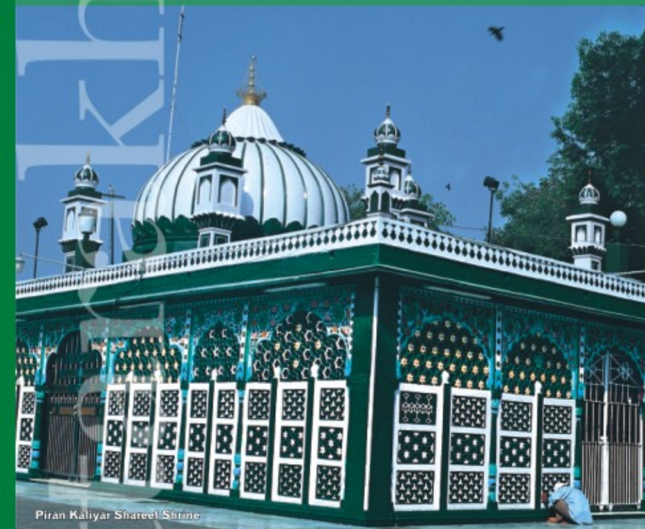
Piran Kaliyar Shireel Shrine