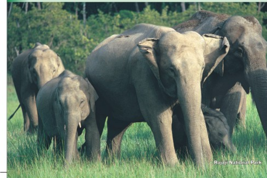
Rajaji National Park