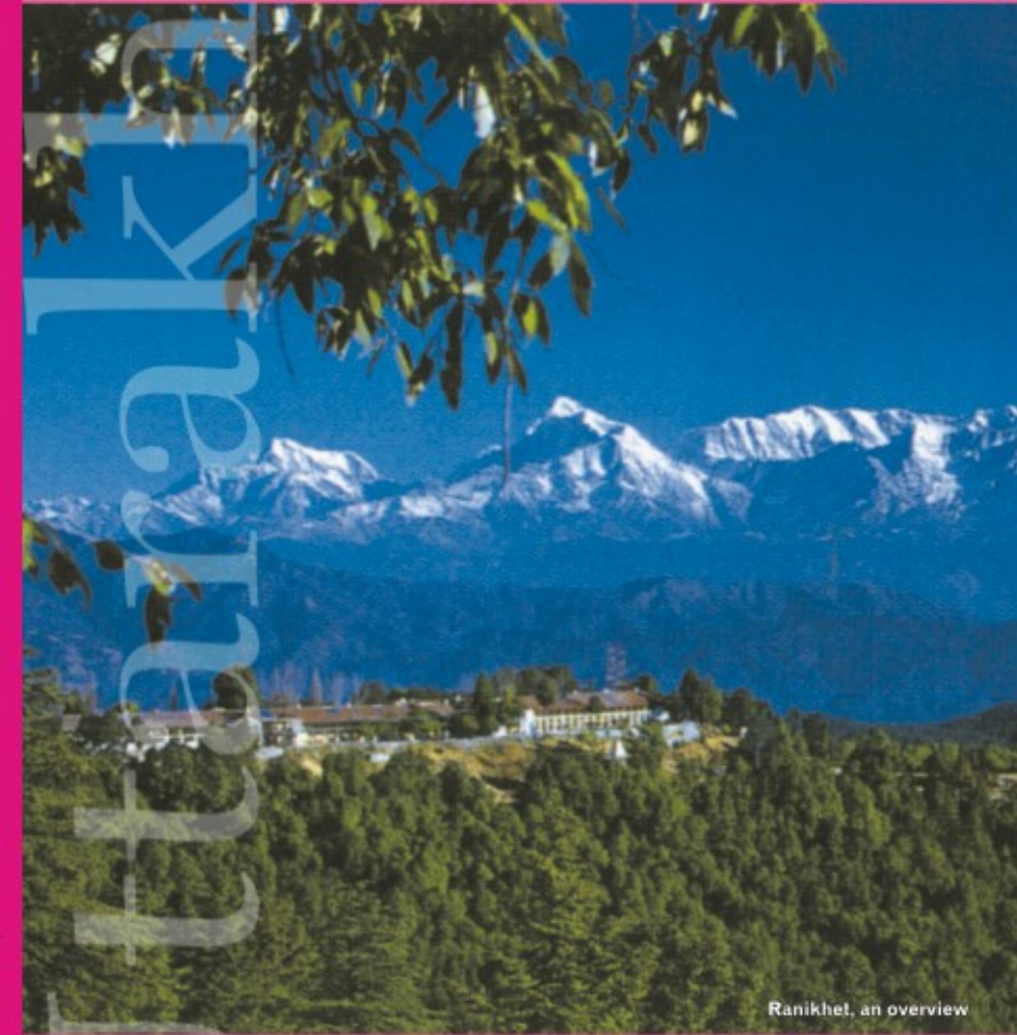
Ranikhet, an overview